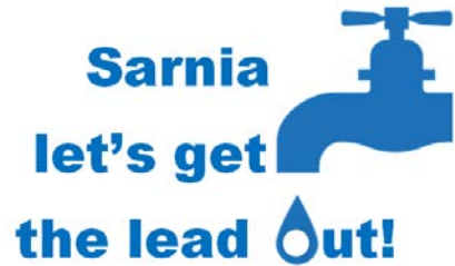
Image: Sarnia let's get the lead out